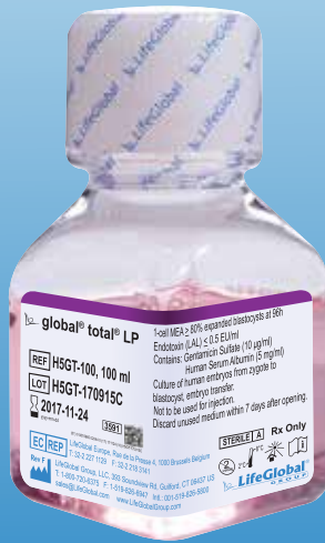
global® total® LP