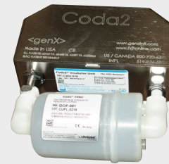
Coda 2 Unit